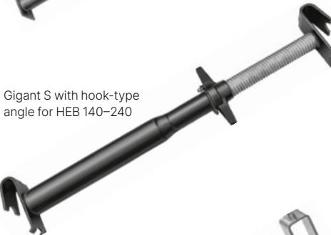
Gigant S with hook-type angle for HEB 140-240