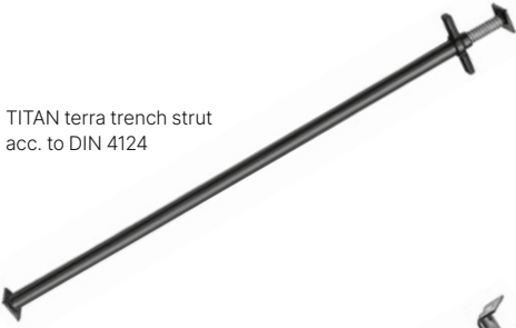
TITAN terra trench strut acc. to DIN 4124