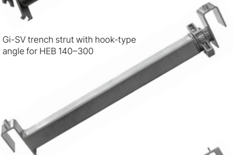
Gi-SV trench strut with hook-type angle for HEB 140-300