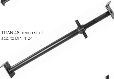
TITAN 48 trench strut acc. to DIN 4124